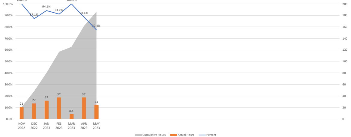
Plenary Roster and Attendance Only